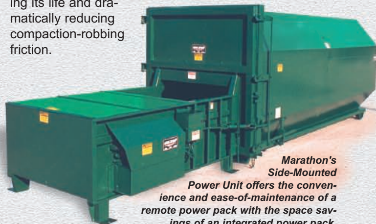
Marathon's Side-Mounted Power Unit offers the convenience and ease-of-maintenance of a remote power pack with the space savings of an integrated power pack.

The packing ram is supported and guided by specially formulated cast iron shoes which ride on replaceable wear strips. This exclusive design protects the charge box floor from the full force of the packing ram, extending its life and dramatically reducing compaction-robbing friction.